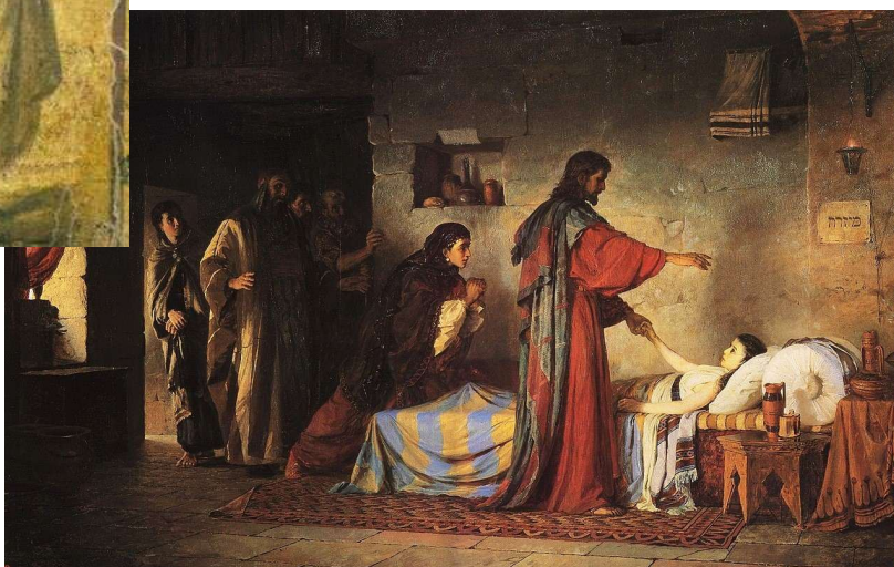
Raising of Jairus' Daughter

In today's Bible story, Jesus met two people who desperately needed his help.